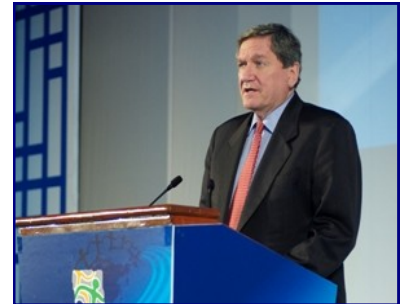
Amb. Richard C. Holbrooke