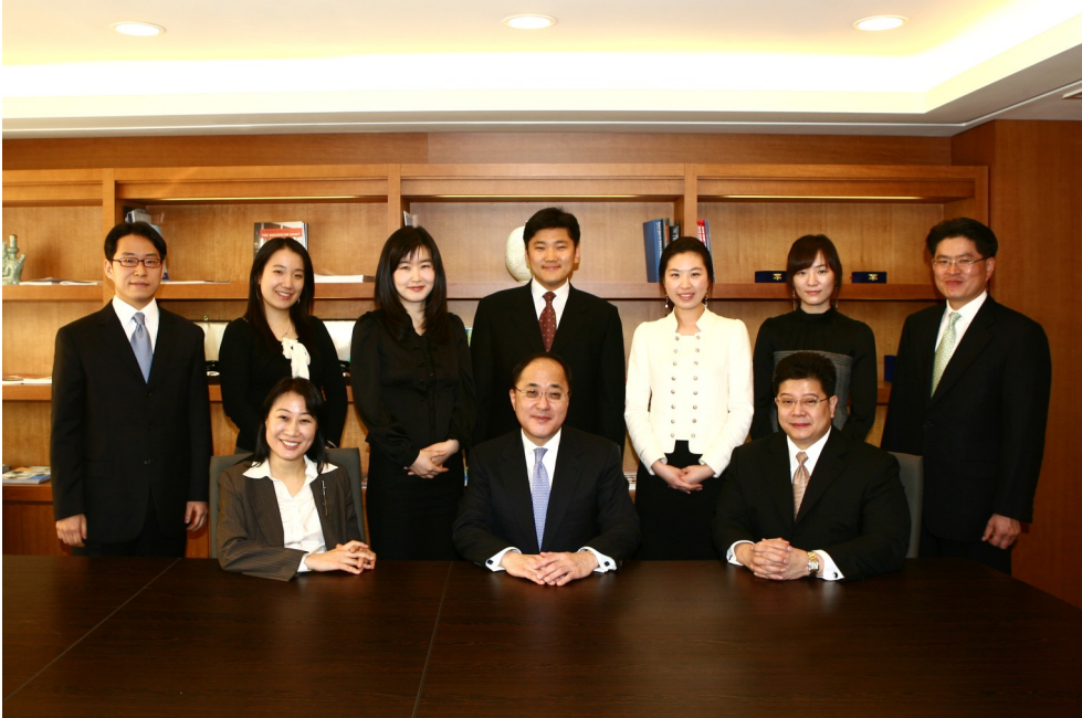
Asia Society Korea Center Staff Members

On April 2, 2008, the Asia Society Korea Center will hold its Inaugural Reception and Gala Dinner at the Seoul Lotte Hotel's Crystal Ballroom. The inaugural event plans to invite both Korean and international figures within the fields of public policy, business, the arts, media, education, and culture.