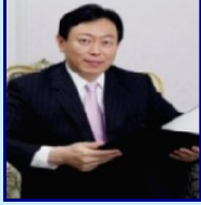
Co-Chairman, Mr. Shin Dong-Bin

The opening of Asia Society's Korea Center comes at a time when South Korea's economic, technological, and cultural presence is being felt around the world.